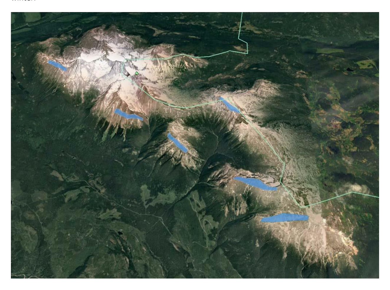
Figure 3 – Ribbons of land (blue) occupied by mountain goats in summer may also be used in winter

The following image is Netazul Mountain north of Smithers BC, a typical large mountain range. The blue areas are a few of the ribbons of land we observed that are used by goat herds in summer. We have limited direct knowledge of the winter homes on Netazul. But from what we know of the criteria for mountain goat winter homes, we anticipate that some of the same ribbons of land serve as home in winter.