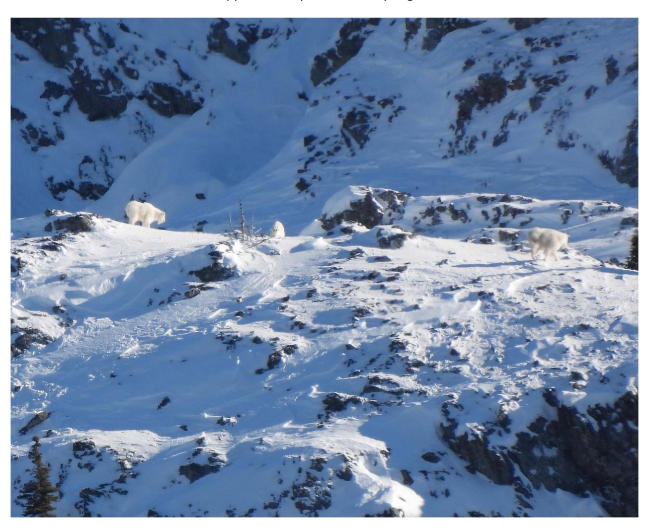
Figure 2 – Three mountain goats on a bench on Mount McKendrick

The total area of the mountain goat main ribbon of land (white) on McKendrick is 1000 meters long x 100 meters wide for a total of 10 hectares, plus the series of small benches measuring a total of 50 meters wide and 400 meters long for another 2 hectares for a grand total of 12 hectares. The entire alpine area is 108 hectares including the cliffs. So the ribbons of land occupied by the mountain goat herd are 11% of the total area. Or approximately 1.2 hectare per goat.